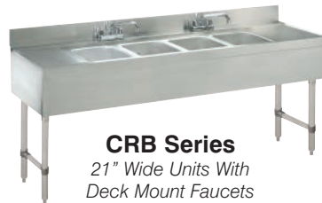
CRB Series 21" Wide Units With Deck Mount Faucets