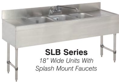
SLB Series 18" Wide Units With Splash Mount Faucets