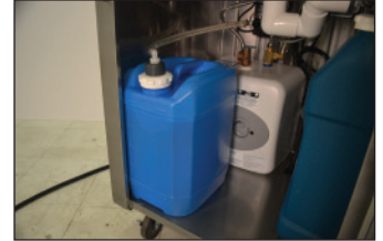
5 Gallon Container for Water Supply Shown for 26C Unit