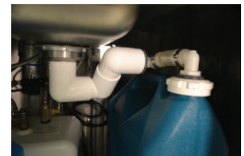
5 Gallon Container for Waste Water Shown for 26C Unit