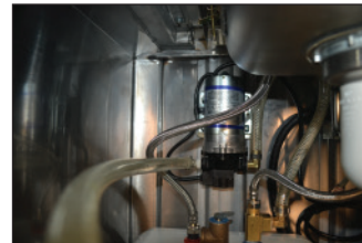
Water Pump Shown for 26C Unit