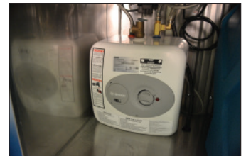
Water Heater Shown for 26CH Unit