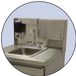
OPTIONAL TA-MSC-1 Shown

Conforms To NSF 61/9 Lead Free Requirements