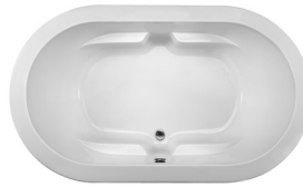
Shown with optional integral armrests