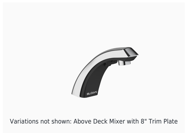
Variations not shown: Above Deck Mixer with 8" Trim Plate